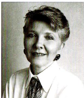
BY LINDA MCKENDRY, vmpc

Retailer Question: “Please help me, I need more ideas re: setting up effective displays. Should our bestsellers be displayed in front of the store, in the rear, or near the cash register?”